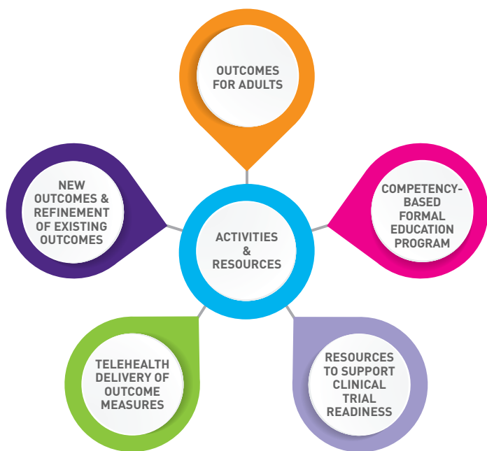
Figure 1: Ongoing PT-related activities across the SMA-IC

Lastly, in collaboration with SMA Europe, this Topic Group has continued engagement with clinical trial centers in Europe. During Q1 2021, SMA Europe launched Infopack 1, entitled “SMA- Pathology, Diagnosis, Clinical Presentation, Therapeutic Strategies, and Treatments,” to member countries. Efforts to translate materials into additional languages are underway. Infopack 2 (“SMA Standard of Care”) and Infopack 3 (“Experiences of Clinical Trials”) are in development.